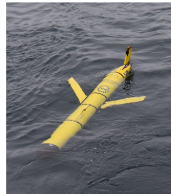
All Global and Coastal Arrays use gliders to collect physical and biogeochemical data to supplement those collected by the stationary moorings. At the Global Arrays, the gliders collect data from the subsurface moorings using acoustic technics and relay the data to shore via satellite.

Following the favorable outcome of a mid-award review in November 2020, and the current operator’s satisfactory performance to date, NSF invited WHOI to submit a proposal for the renewal of funding for the O&M of OOI. NSF completed the process of renewing the O&M award through an open, merit-based external peer-review process, resulting in an award to WHOI as the OOI Program Management Office, that started October 1, 2023, and runs through September 30, 2028. NSF is engaged in a process to continue support for the facility beyond the current award period. Currently, there are no plans for disposition of the facility.