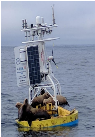
Coastal Endurance Surface Buoy with sea lions.

The Woods Hole Oceanographic Institution (WHOI) is the primary awardee and managing organization for OOI, responsible for overall operations, management, and maintenance. WHOI provides sub-awards to Oregon State University (OSU) and University of Washington (UW), and all three institutions comprise the OOI Implementing Organizations with the following responsibilities: