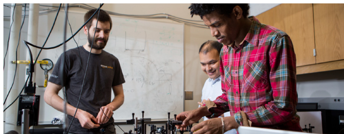
REU student working with mentor and supervisor in the lab.

NSF also partners with industry leaders like Micron and Intel to train and build a diverse semiconductor manufacturing workforce.