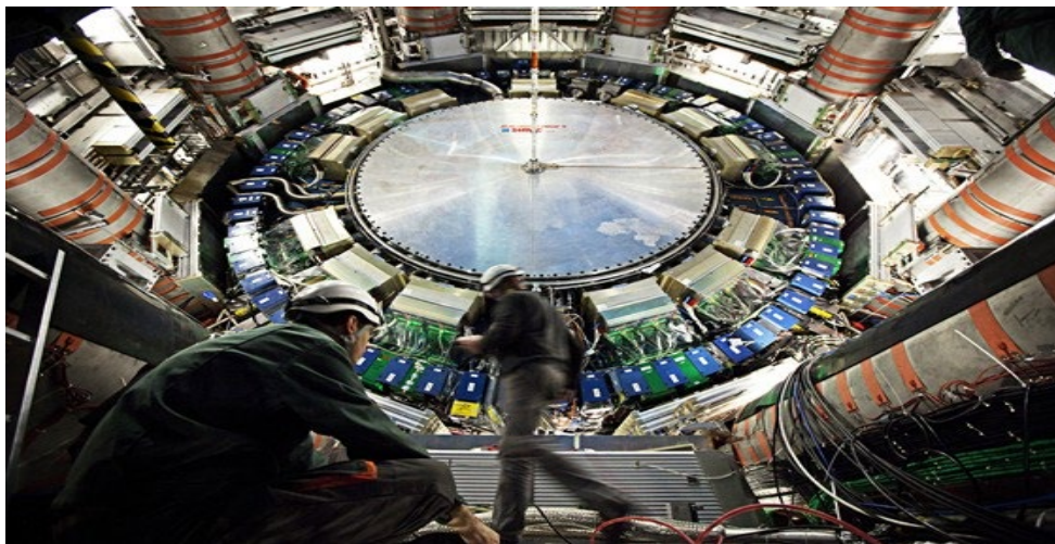
View of the ATLAS detector.

CERN's policy is to dispose of all detector components when they are no longer used in the detectors. NSF will be responsible only for covering its share of the demolition costs to remove each detector from its underground operating location and transport it to the surface for disposal by CERN. At the Full Life-Cycle Cost Reviews each detector collaboration estimated these costs at approximately $1-2 million (not escalated).