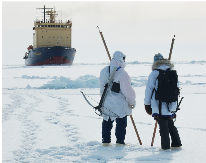
Arctic Native ice testing stick.

Additional funding opportunities to support the co-production of knowledge and include Indigenous people and organizations in Arctic research can be found on NSF's Office of Polar Programs page.